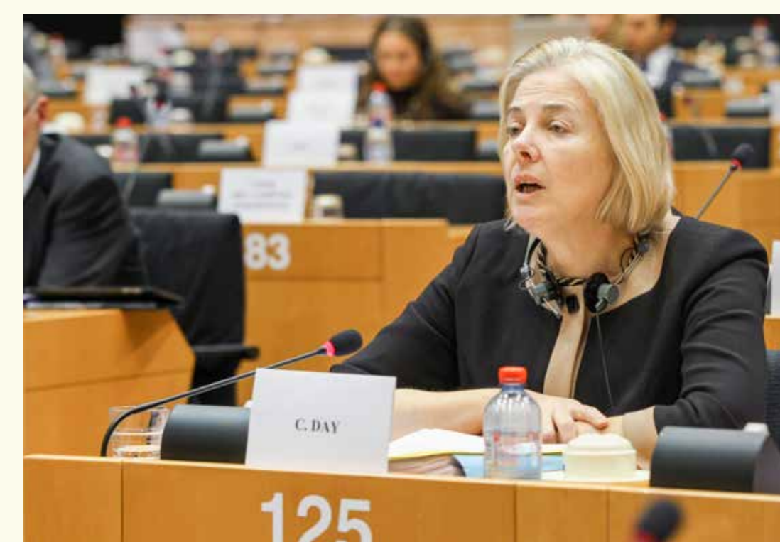
Catherine Day

Secretária-Geral da Comissão Europeia 2005 - 2015