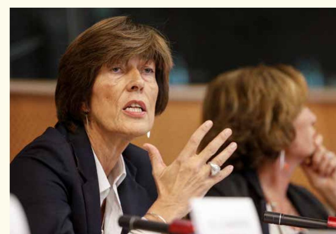
Kristīne Vergēra